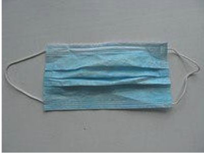
FACE MASKS (For children and adults)

Immaculate Conception School is preparing for a possible reopening in the fall. Please help us. WE ARE LOOKING FOR THE FOLLOWING DONATIONS: