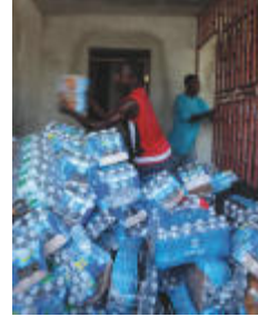
CASES OF WATER