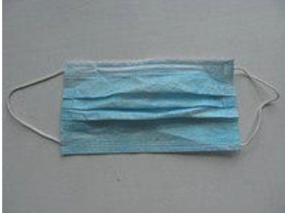
FACE MASKS (For children and adults)

WE ARE LOOKING FOR THE FOLLOWING DONATIONS: