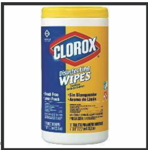
C CLOROX OR LYSOL WIPES