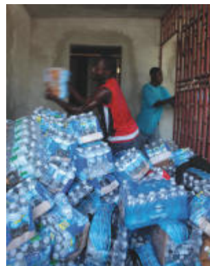
CASES OF WATER