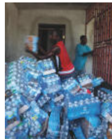
CASES OF WATER