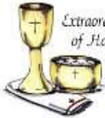
Extraordinary Ministers of Holy Communion