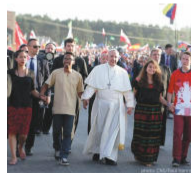
Synod on Synodality

Over the coming months, Catholics from around the world will be participating in the Synod on Synodality.