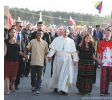
Synod on Synodality

Over the coming months, Catholics from around the world will be participating in the Synod on Synodality.