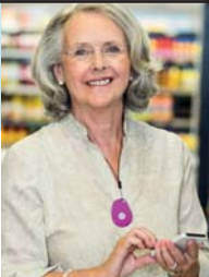
GPS Mobile Above

No Contract • No Fees • Easy Setup • md-medalert.com CALL 800-890-8615